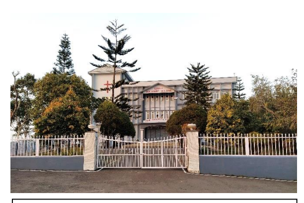
Aizawl Theological College, an ecumenical seminary of the Presbyterian Church in Aizawl

Aizawl has a largely young population, and this is very much evident if one visits the city. The youth are engaged in a culture revolving around volunteering through the church and culturally active groups such as the YMA. The YMA conducts awareness and other local voluntary activities, and this has been in practice for a long time now. This has thus, led to active participation of the youth across the city in various relief and support activities through YMA, taskforce, college groups and the church.